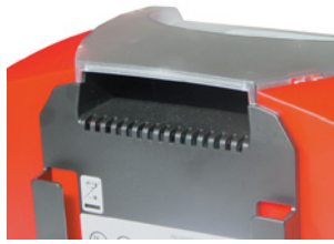
Non slip rear manual grip