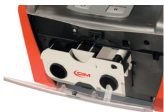
Ribbon cartridge EasyLoad

As many as 112 different configurations are available!